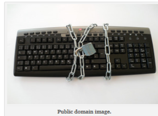
Public domain image.

Your ID and password are probably also what allow you to gain off-site access to licensed information resources purchased on your behalf by the library: online journals and databases, ebooks, and other scholarly products licensed for campus use.