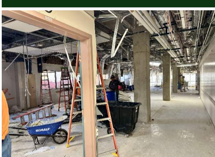
Labs B112–B114 – Gone!

Biomed, 1 st Floor is under renovation. Entrances to construction areas are marked and areas are fully off limits to UAMS employees - THESE ARE HARD HAT AREAS, UAMS employees should not be accessing the renovation area at any time.